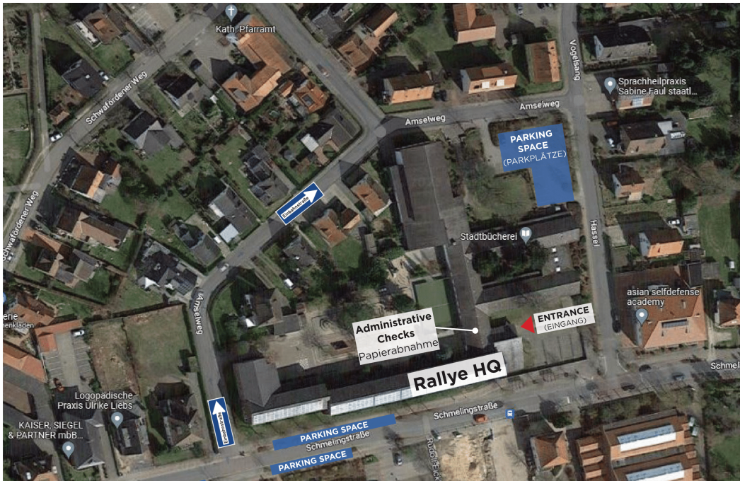
Rallye HQ Grundschule Schmelingstraße